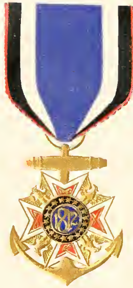
Insignia of the Society of the War of 1812.